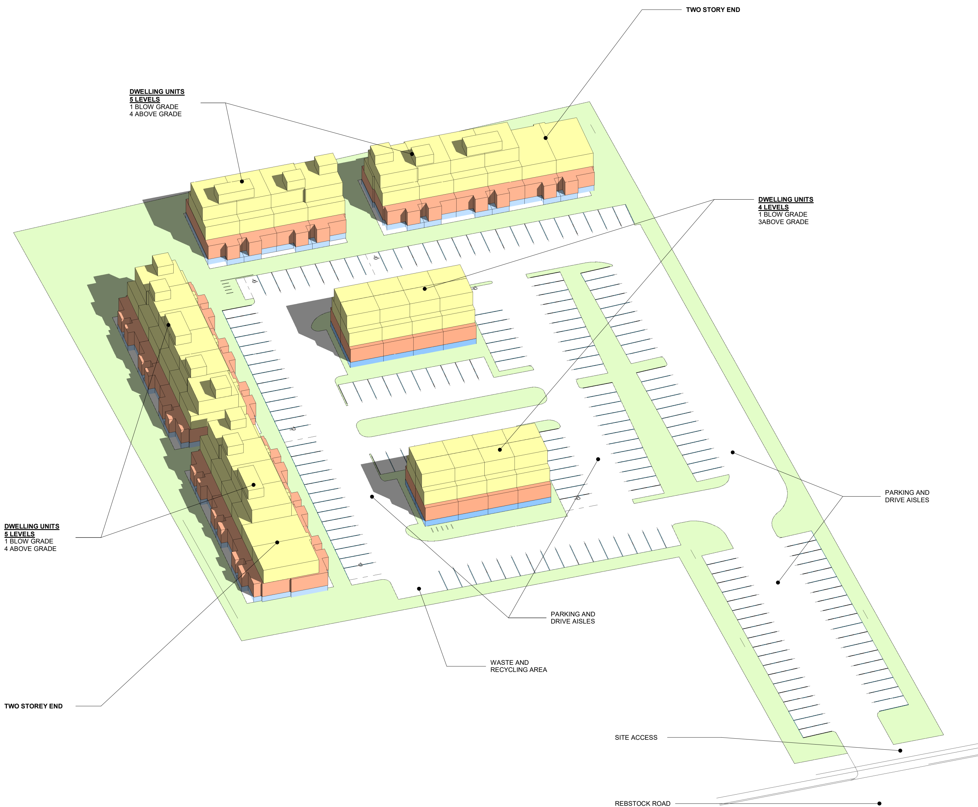
1 PROPOSED BIRD'S EYE VIEW