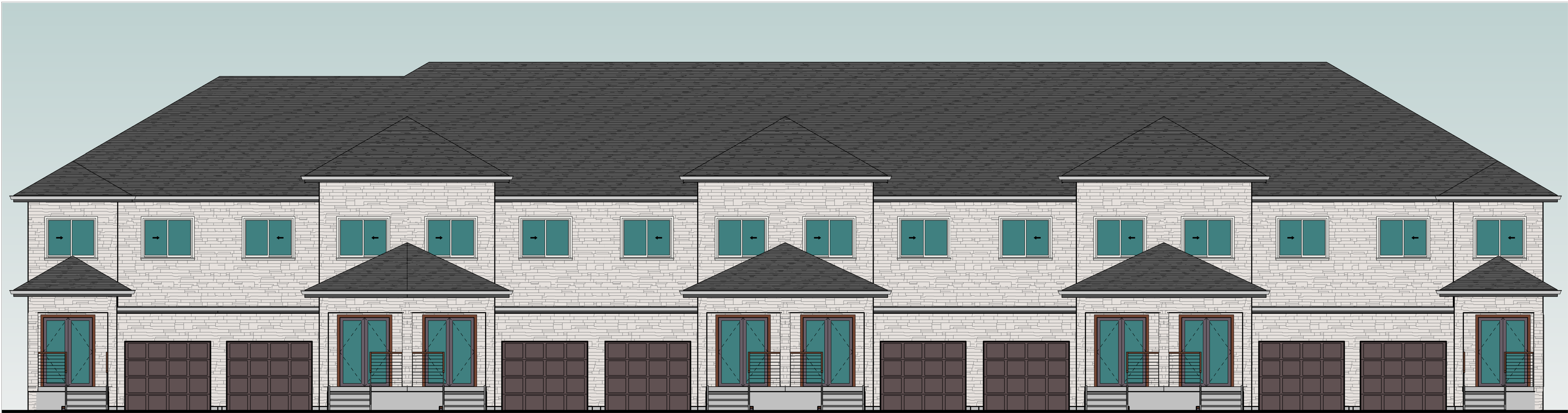
1 NORTH ELEVATION 3/16" = 1'-0"