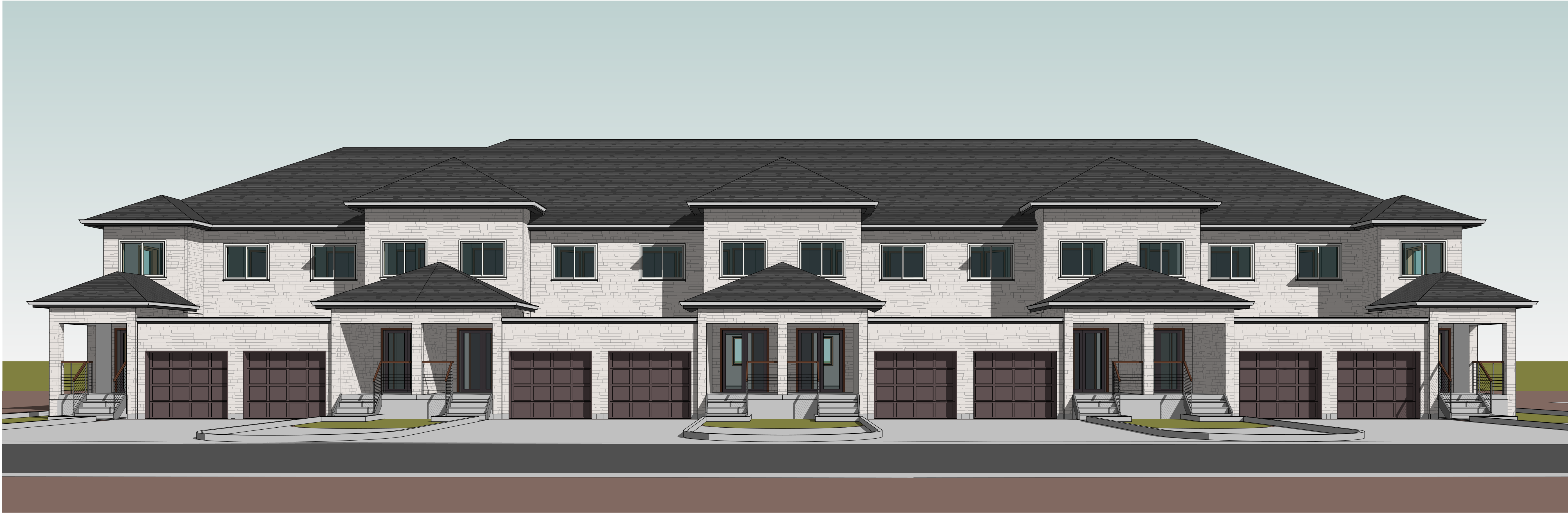
1 NORTH VIEW