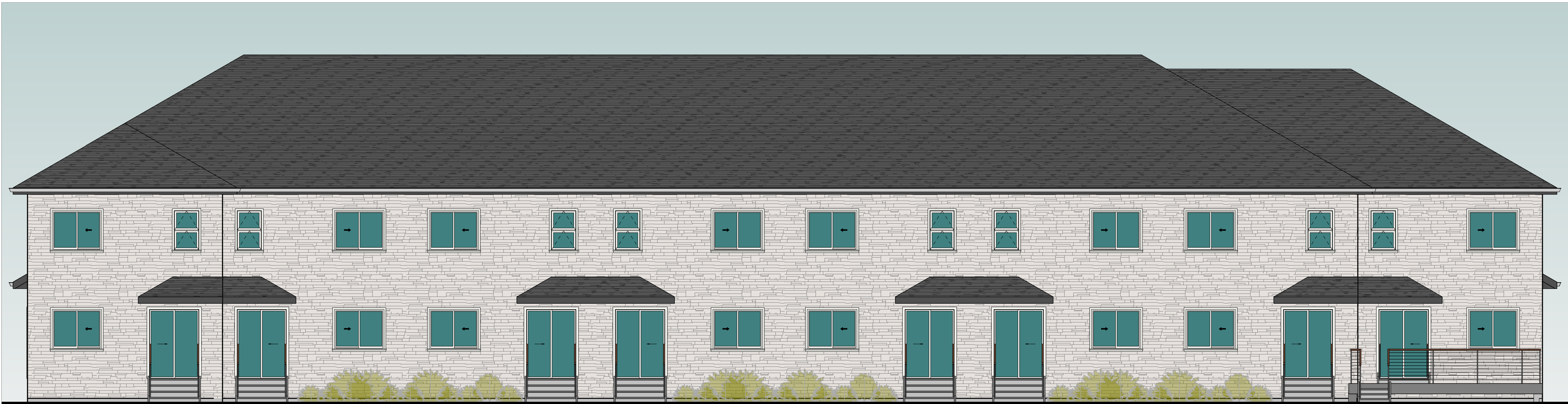
2 SOUTH ELEVATION 3/16" = 1'-0"