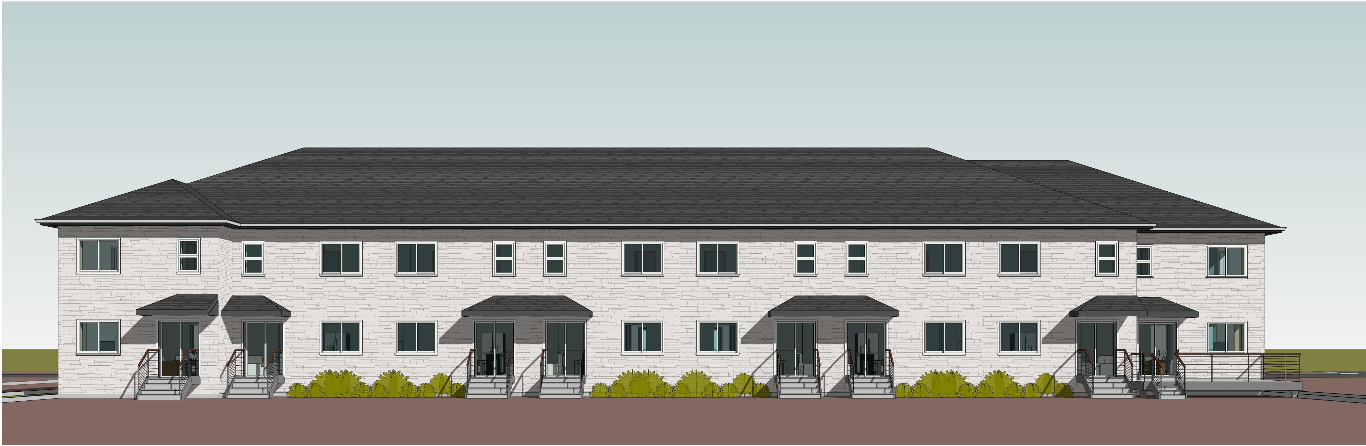
2 SOUTH VIEW