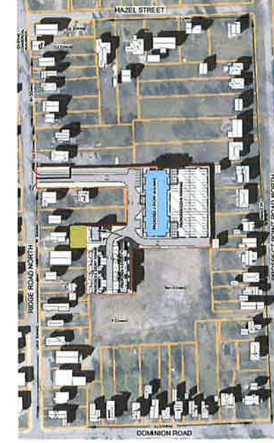
SEPTEMBER 23, 3PM

All contractors and/or trades shall verify all dimensions, notes, site and report any discrepancies prior to commencement of the work. This drawing not to be scaled, all drawings, prints and related documents are the property of the architect and must be returned upon request. Reproduction of drawings and related documents in part or in whole is strictly forbidden without written consent. Drawings to be for the purposes for which they are issued.