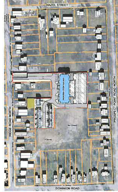
SEPTEMBER 23, 12PM