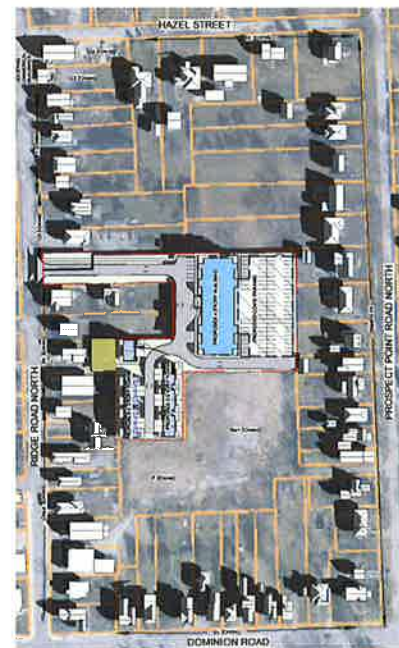
MARCH 20, 9AM