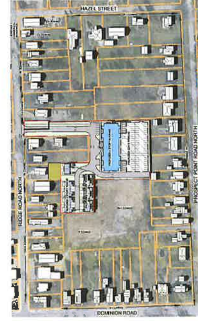
JUNE 21, 3PM