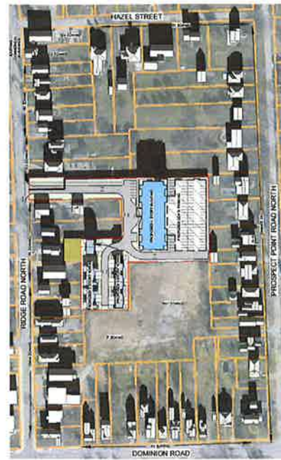
DECEMBER 21, 12PM