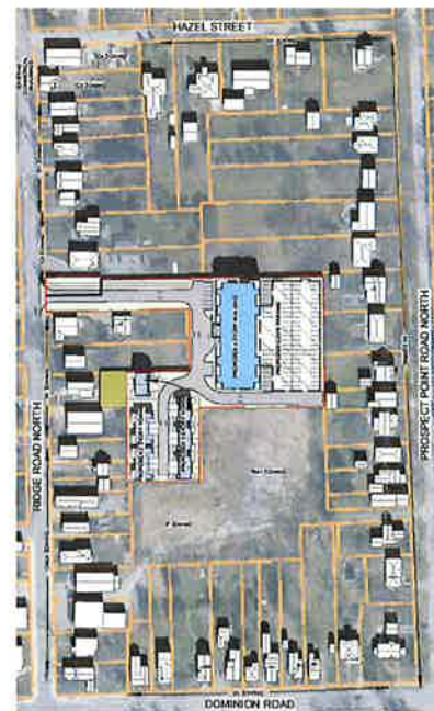
MARCH 20, 12PM