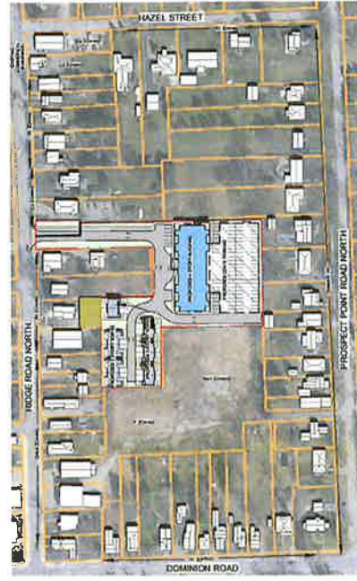
JUNE 21, 12PM