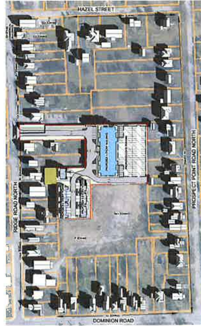
SEPTEMBER 23, 9AM