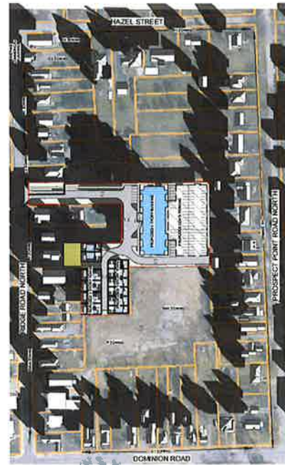
DECEMBER 21, 9AM