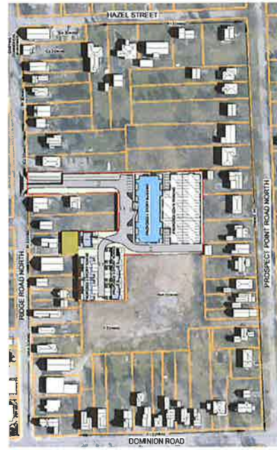
JUNE 21, 9AM