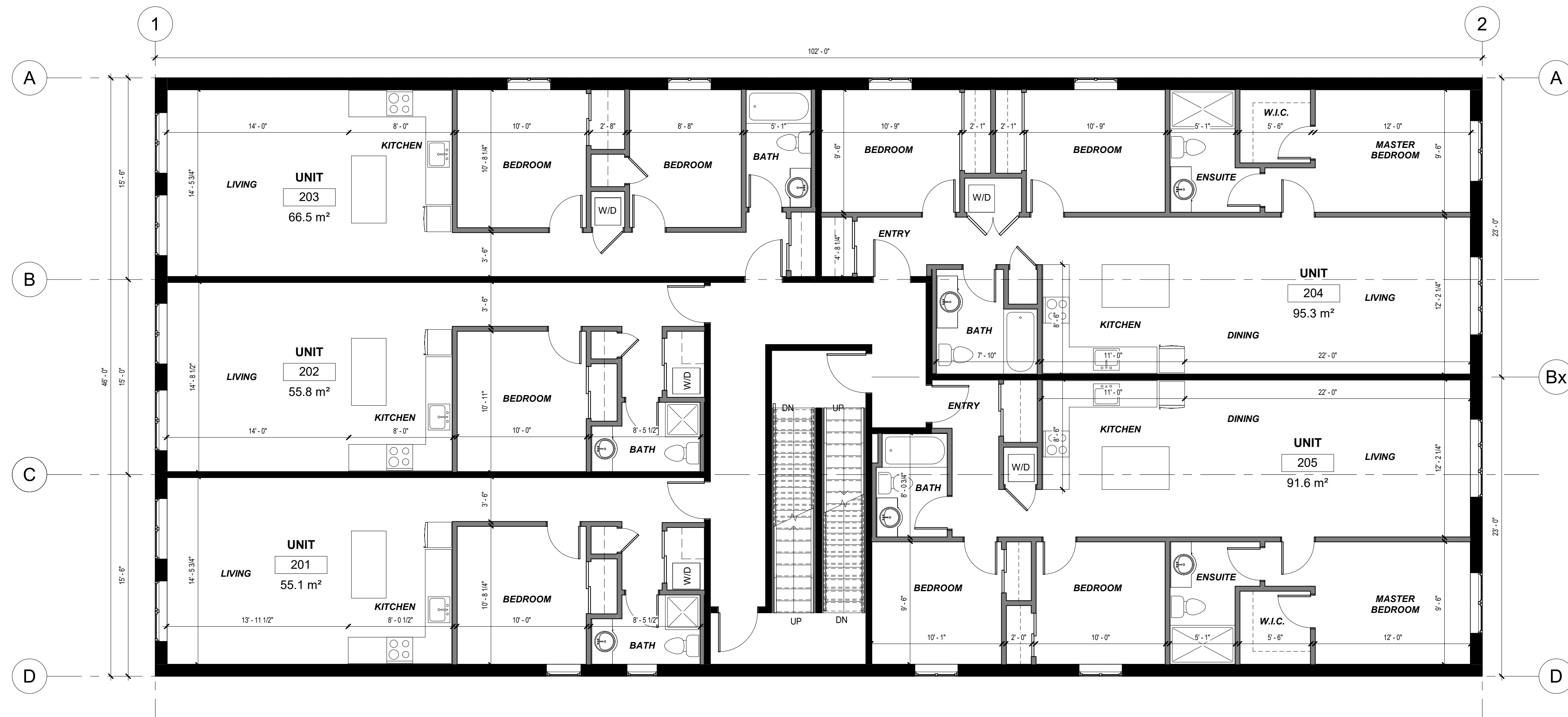
② SECOND & THIRD FLOOR PLAN 3/16" = 1'-0"