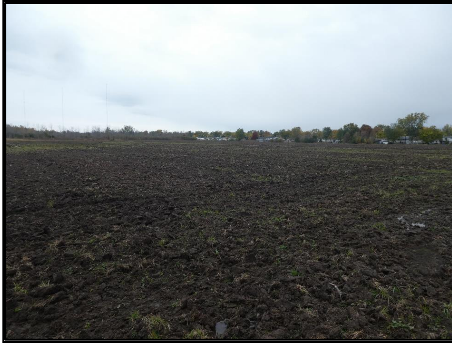
Photograph 1. Subject Lands Supporting Active Farm Field – Looking Southwest Across to Crescent Road (October 20, 2022)