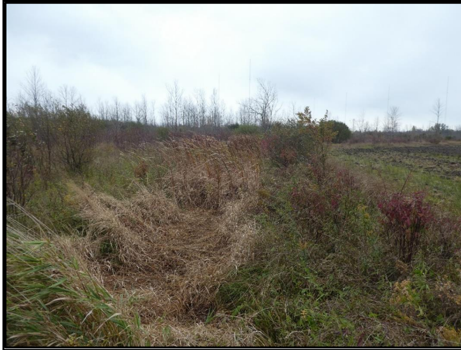
Photograph 3. Watercourse and Cultural Thicket/Meadow Community in Watercourse Block 30 of the Draft Plan of Subdivision – Looking South (October 20, 2022)

The meadow/thicket community describe in the NAIS for Area 295/296 was found to be retained in the plan of subdivision Watercourse Block 30 ( Photograph 3 ). The headwater watercourse within Block 30 flows to the Kraft Drain to the south and supports an ephemeral flow regime and does not support direct fish habitat an represents Type 3 Marginal fish habitat by providing downstream flows to the Drain.