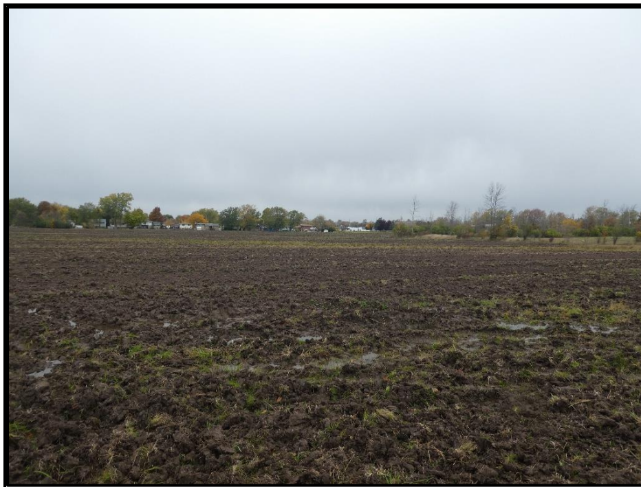
Photograph 2. Subject Lands Supporting Active Farm Field – Looking Northwest Across to Crescent Road (October 20, 2022)