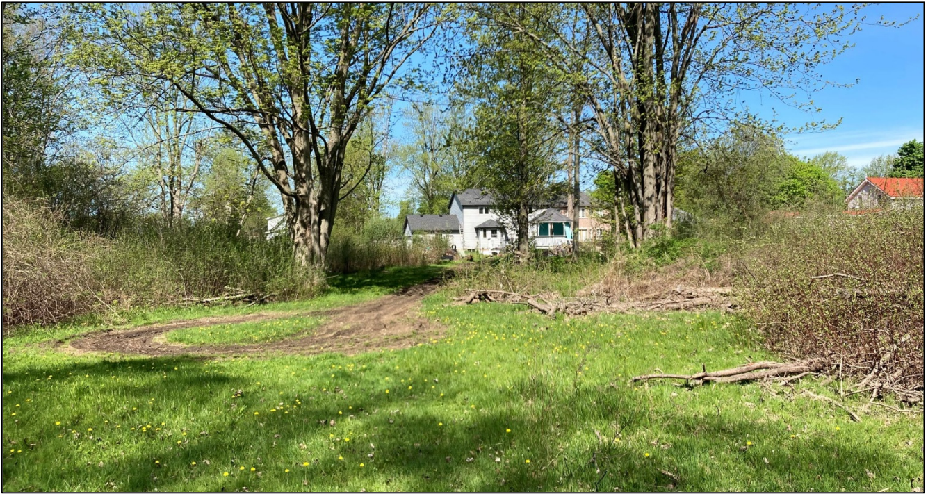
Photo 1: View of the site's rear yard, facing west from the easterly unopened road allowance. Note the manicured lawn, patches of shrub thicket, and the few remaining live trees following the ordered removal of killed Ash trees.

Photos 1, 2 and 3, below, depict representative conditions observed by Myler and Culture at the site on 13 May 2022: