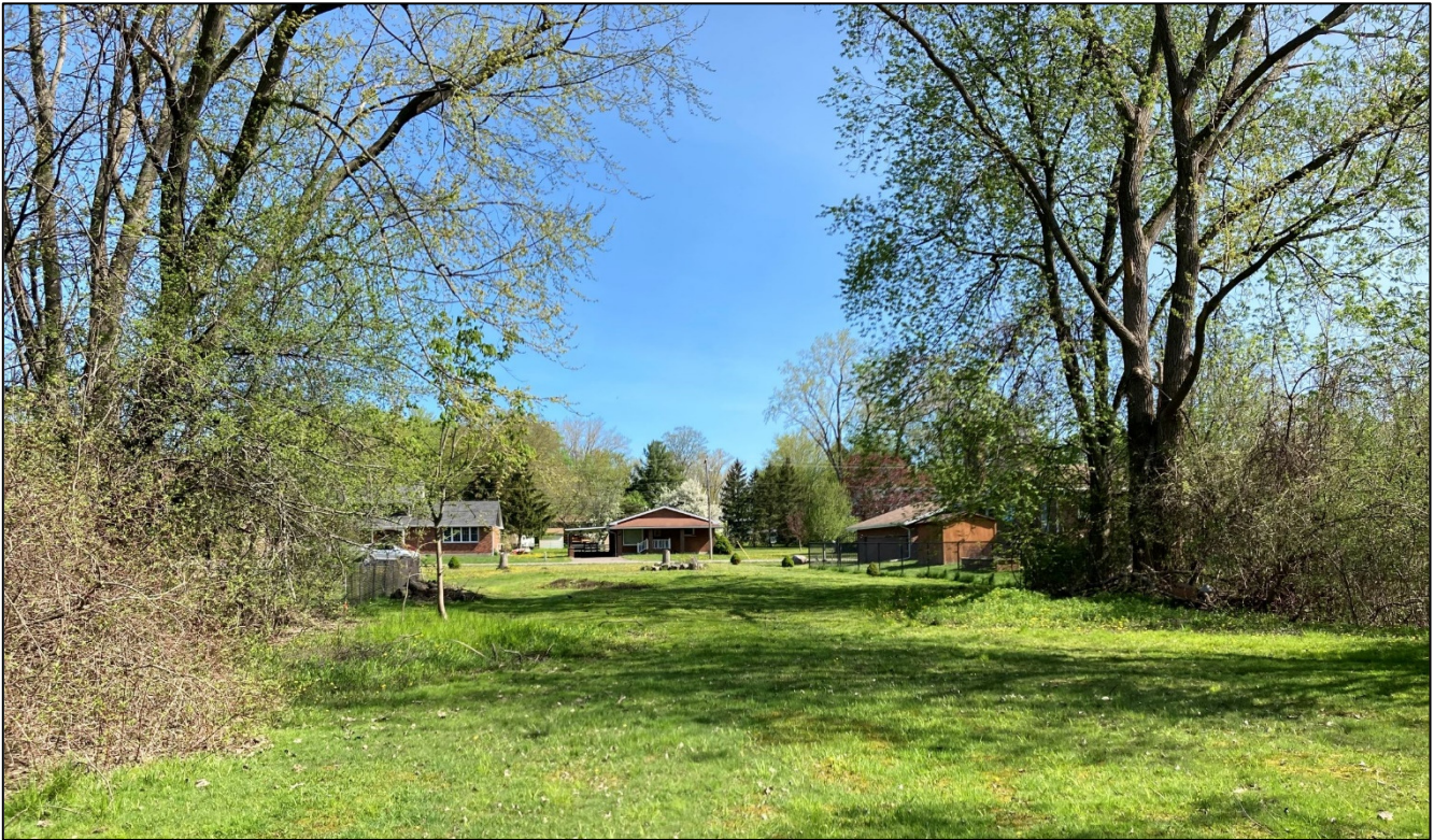
Photo 3: A north facing view of the unopened road allowance that is east of the site, showing its current condition as manicured turf.

Myler’s observations confirmed an absence of woodland at and adjacent to the site. The absence of woodland was confirmed to be the consequence of Emerald Ash Borer infestation that killed the dominant Ash trees and the subsequent Town By-law Order that required removal of the dead standing trees.