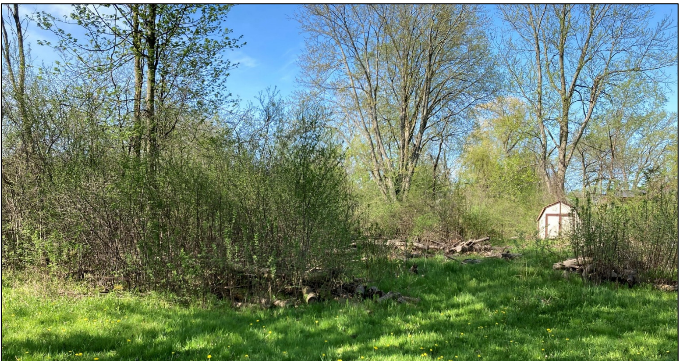
Photo 2: A south facing view across the site's rear yard shows manicured lawn, shrub thicket and in the background beyond the garden shed a portion of the shrubby, sparsely treed hedgerow-like southerly unopened road allowance.