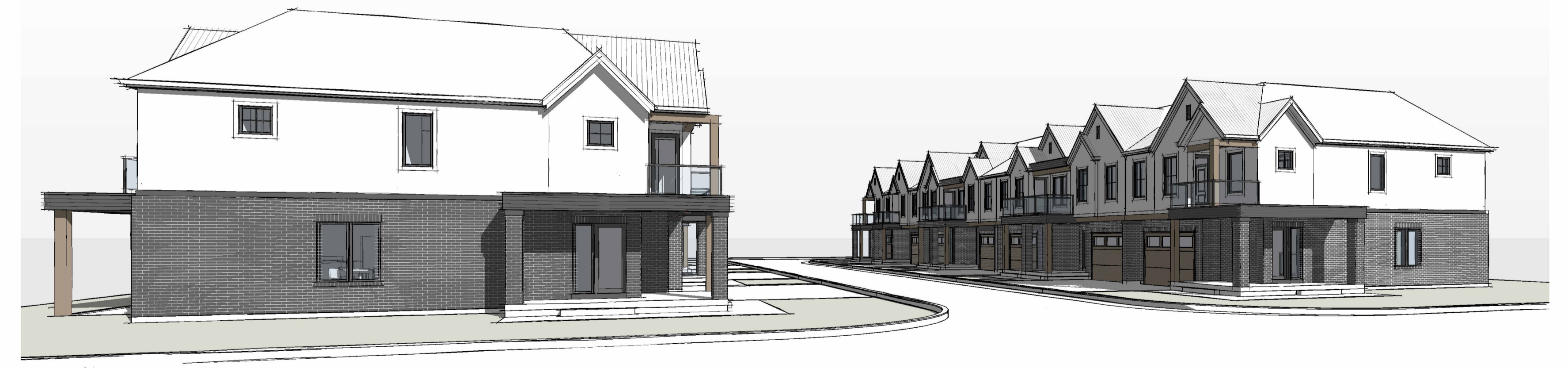
DOMINION ROAD PERSPECTIVE