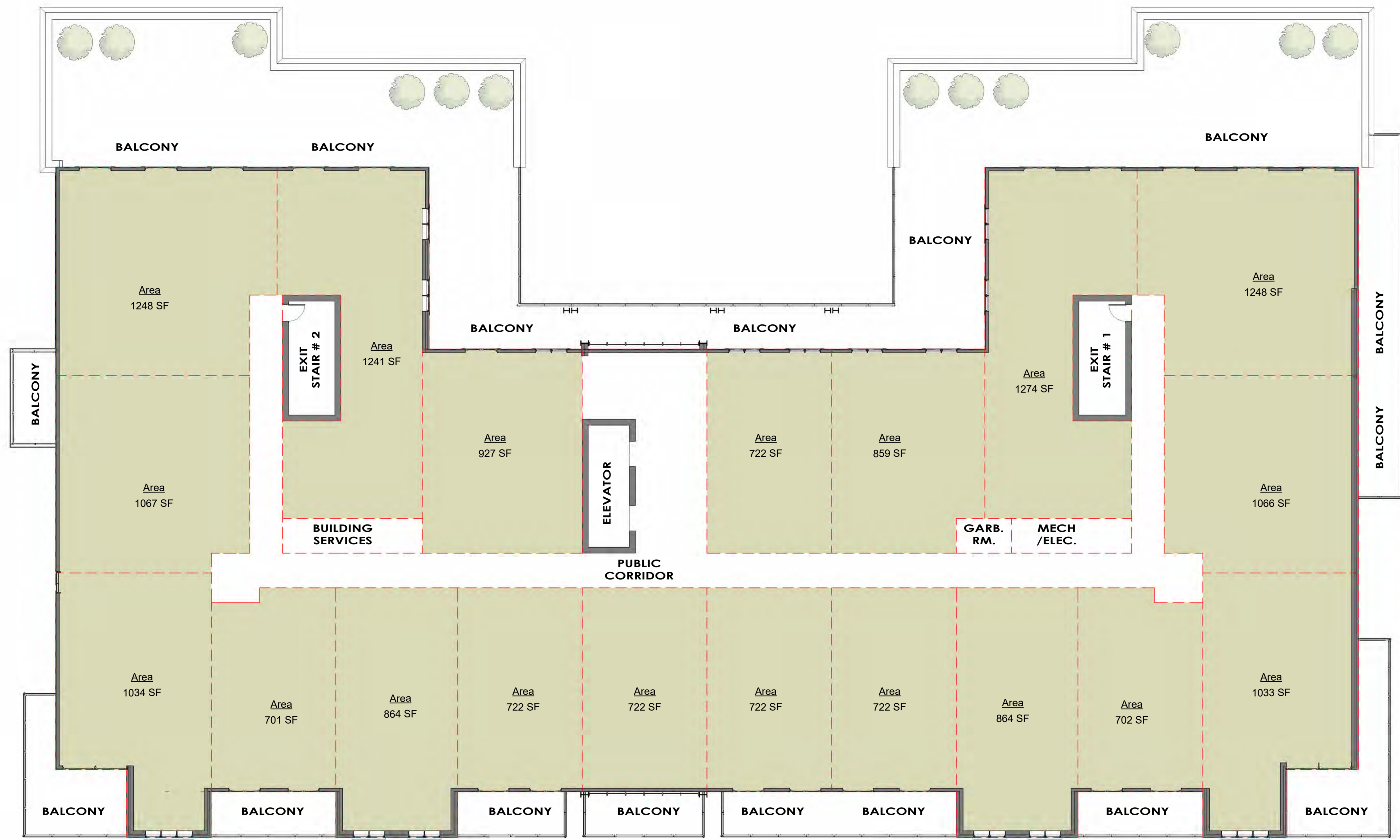
4TH FLOOR PLATE SCALE: 1"=10'

All contractors and/or trades shall verify all dimensions, notes, site and report any discrepancies prior to commencement of the work. This drawing not to be scaled, all drawings, prints and related documents are the property of the architect and must be returned upon request. Reproduction of drawings and related documents in part or in whole is strictly forbidden without written consent. Drawings to be for the purpose for which they are issued.