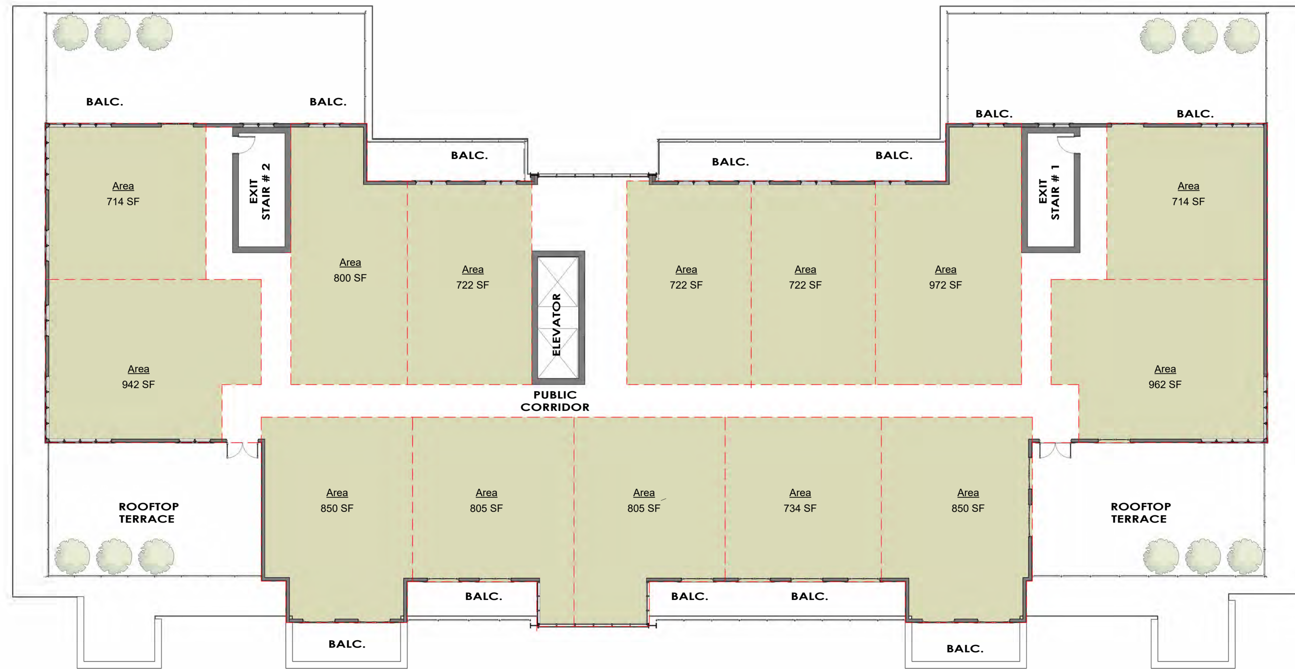
5TH FLOOR PLATE SCALE: 1"=10'

All contractors and/or trades shall verify all dimensions, notes, site and report any discrepancies prior to commencement of the work. This drawing not to be scaled, all drawings, prints and related documents are the property of the architect and must be returned upon request. Reproduction of drawings and related documents in part or in whole is strictly forbidden without written consent. Drawings to be for the purpose for which they are issued.