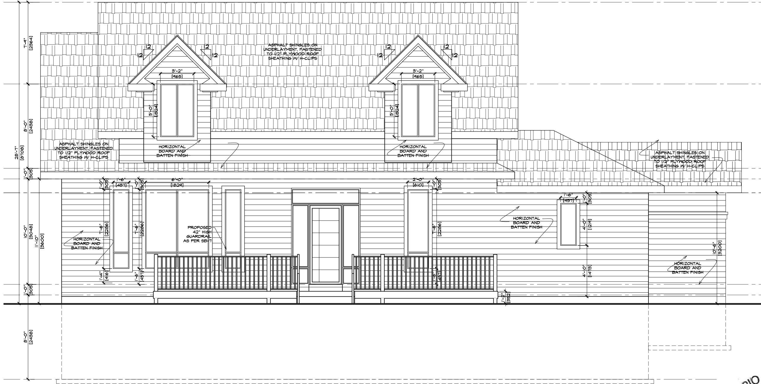
LEFT ELEVATION SCALE: 1/8"

ALL DRAWINGS ARE PROPERTY OF DESIGNER AND MUST BE RETURNED UPON REQUEST DRAWINGS © ARCHITECT OSAMA ABO NASSAR WELLAND, ONTARIO, CANADA. REPRODUCTION IN ANY FORM WITHOUT PERMISSION OF DESIGNER IS PROHIBITED. THIS DRAWING IS NOT TO BE USED FOR CONSTRUCTION PURPOSES UNTIL COUNTERSIGNED OSAMA ABO NASSAR, OAA ARCHITECT