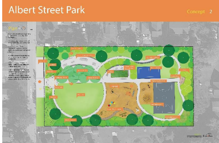
Albert Street Park concepts as presented at the public open house

The following represents a summary of the responses collected from the paper survey and personal discussions on the concepts presented at the open house (July 16, 2019). In total, 3 paper surveys were received and there were 8 community members that attended the open house .