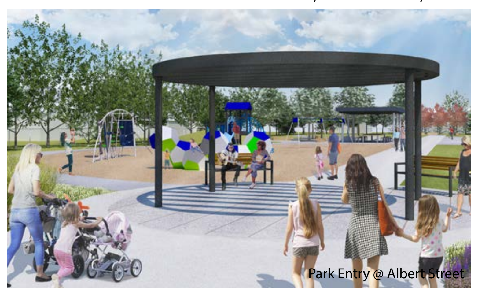
APPENDIX "2" TO ADMINISTRATIVE REPORT PDS-54-2019, DATED OCTOBER 15, 2019