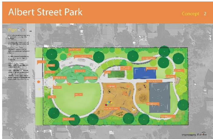
Albert Street Park concepts as presented at the public open house

The following represents a summary of the responses collected from the paper survey and personal discussions on the concepts presented at the open house (July 16, 2019). In total, 3 paper surveys were received and there were 8 community members that attended the open house .