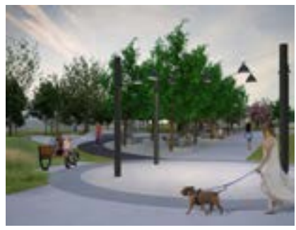
1\_ Looking into the park from entry at Albert Street