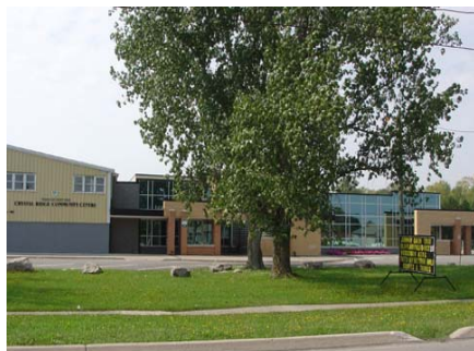
Crystal Ridge Park