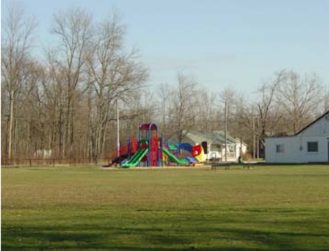
Bill Connolly Field