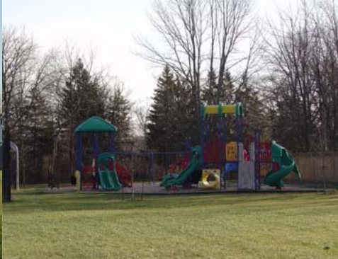
Ridgeway Lions Park