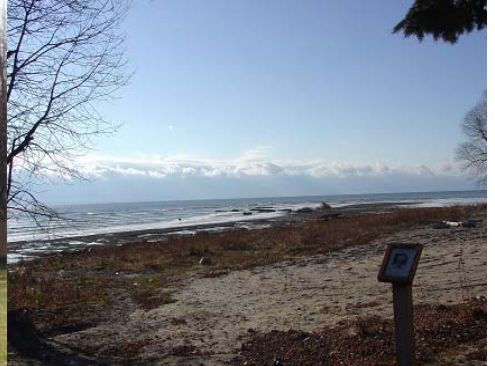
Wavecrest and Bernard Beaches